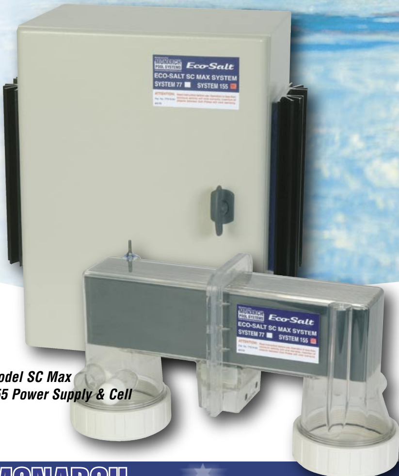
Model SC Max 155 Power Supply & Cell

SC Max for small to medium Public, Resort, Hotel and School Swimming Pools